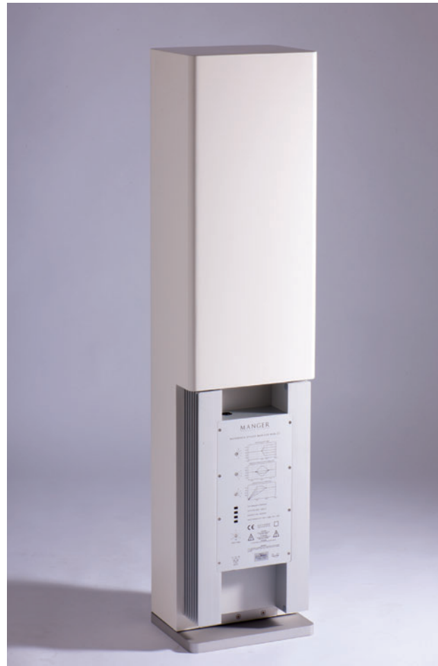
The backside of the MSMs1 offers many options for individual adjustments