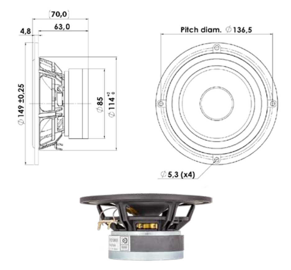
The new MKII chassis is more open than before, which improves the air flow.

Note, since we now use a new factory and measuring conditions, the measures are updated. We also recommend paring drivers from the same factory. Please see our web site for replacement and upgrade policys. Measuring conditions: Factory new driver, "broken in" 30min. Half space free-field (2 pi) above 100 Hz. Anechoic room 6x7x8 meters. IEC specs. refer to IEC 60268-5 third edition. All EAD products are RoHS compliant. Sensitivity/2.83V/1m/300-1000Hz.