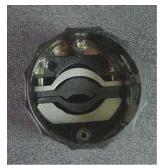
Secure Metal Cable Clamp