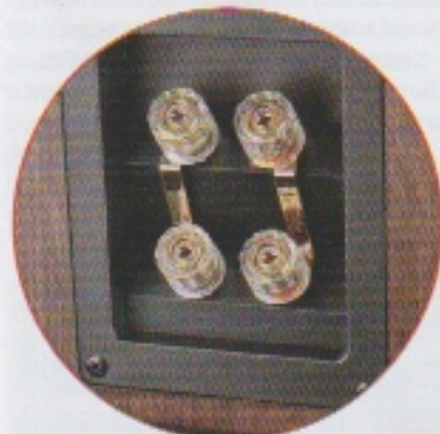
The twin pair of speaker terminals at the back gives you the option to bi-wire

That's not to say they're one-dimensional or unable to do delicate. Massive Attack's brooding slow-burner, Angel , starts slowly, with the Fyne F303s able to showcase impressive attention to detail and comfortable handling of subtle rhythms. They're almost asking to be played at decent volume, but even at lower levels they demonstrate a good touch, with notes stopping and starting precisely. Voices have texture and warmth, not as immediate and open as some rivals, but with plenty of insight.