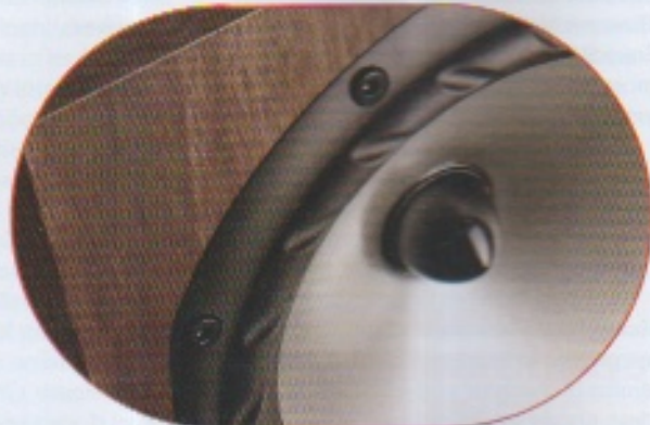
Fyne says placing the mid/bass drivers and tweeter in the D'Appolito driver configuration helps deliver a wider sweet spot