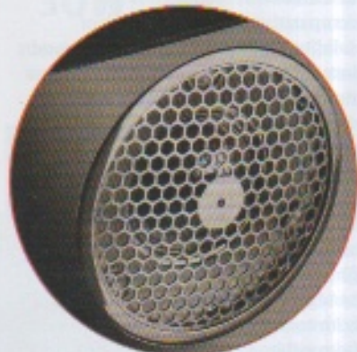
The 25mm polyester dome tweeter sits between two 15cm mid/bass drivers