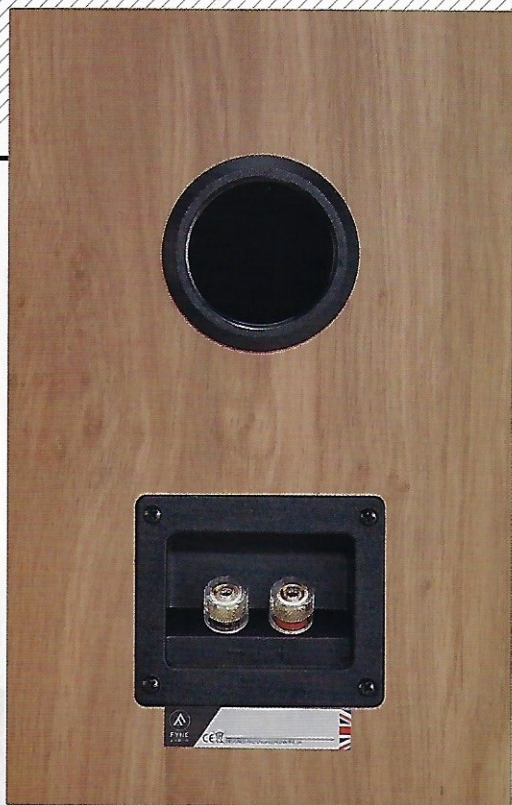
LEFT: Single, gold-plated 4mm binding posts are provided beneath the F301's substantial, rear-facing reflex port

Forward frequency response [Graph 1, below] was measured at 1m on the tweeter axis with the bass-mid driver's grille removed. While the overall trend is pretty flat, the unevenness is enough to result in rather high response errors of \pm 5.0 dB and \pm 4.5 dB respectively, although pair matching over the same 200Hz-20kHz frequency range was good at \pm 0.8 dB. Diffraction-corrected nearfield measurement showed bass extension to be 55Hz (-6dB re. 200Hz), entirely in line with expectations for a compact standmount design. The CSD waterfall [Graph 2, below] hints at resonances associated with the 800Hz and 1.4kHz response peaks but at higher frequencies resonance suppression is generally good, albeit with modes associated with the 4kHz peak and 8kHz 'wiggle' visible in the on-axis responses. KH